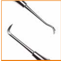
Osteo Mitchell 4