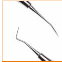
Wards 1 Small