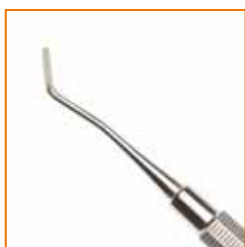
Hatchet Blacks 53