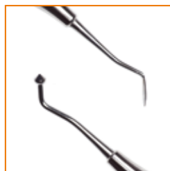
Carver Shofu 3