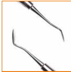
Hollenbach 3 Small