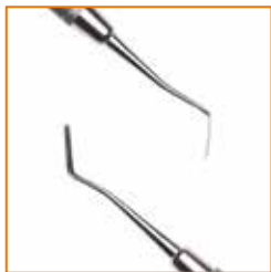
Inter Proximal Carver