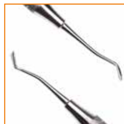
Carver Walls 3