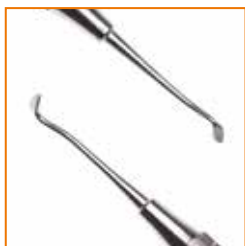
Carver Tanner 5T