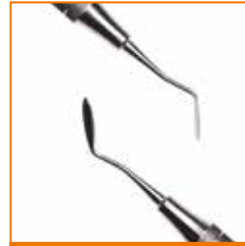
Hollenbach 3 USA