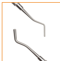
Shofu Condenser 2