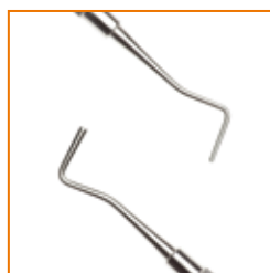
Shofu Condenser 1