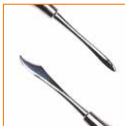
Wax Carver 5